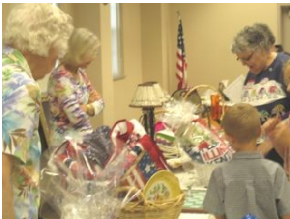
The Silent Auction Table was a popular place!